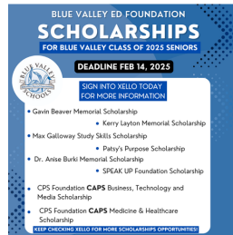
Blue Valley Ed Foundation Scholarship