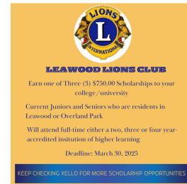
Leawood Lions Club Scholarship